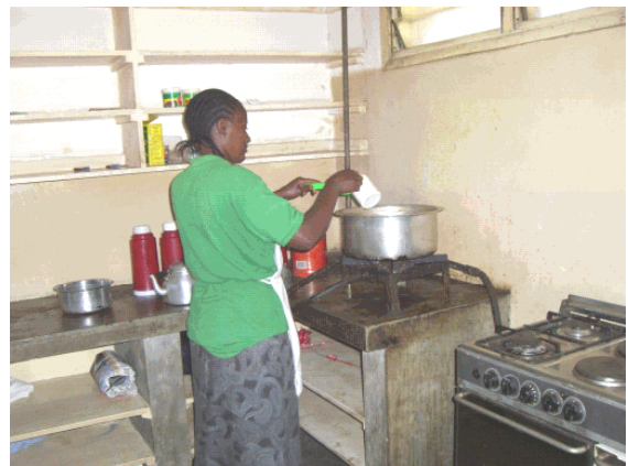
Cooking with Biogas

New guidelines for DIAKAID were agreed and would be sent out with the Minutes and will also be available on the website.