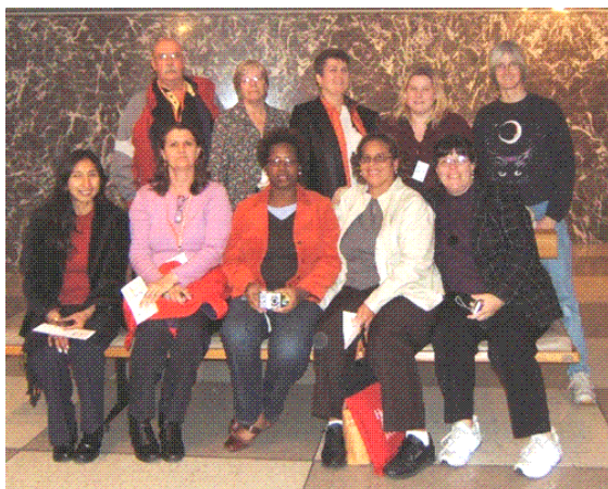
DOVE group at United Nations

The programme was developed by a group in New York who provide learning and action programmes. The group had a facilitator who did theological and social systems reflection helping the group make connections and develop programmes that they could take home with them. The participants were expected to share the information with their home country groups and assist in developing anti violence programmes and awareness of violence.