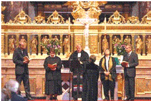
Inauguration Berlin Cathedral