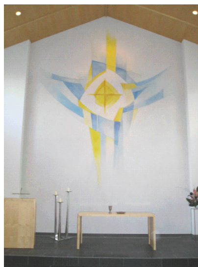
Church in Riehen/Switzerland