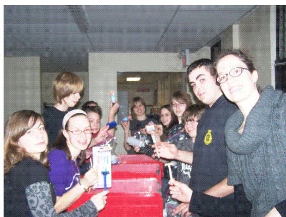
Youth filling the bags for the homeless

In March 2008 a group of young people had a retreat called "Walk the Talk". They walked 5.6 km one day with all their personal gear in shopping carts. Then they also made two meals for the homeless and took it to one of the high risk shelters for drug and alcohol connected homeless people.