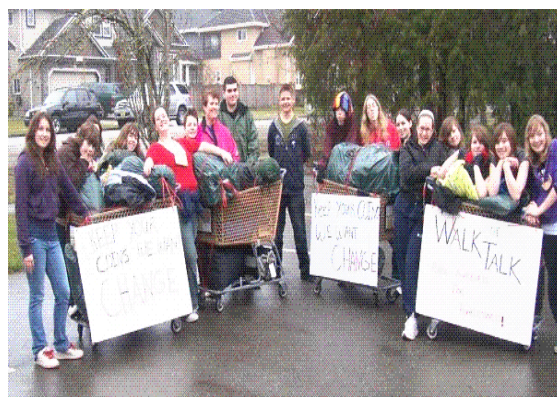
"Walk the Talk" group

Diakonia of the United Church of Canada held their biennial Conference in April 2007 in Alberta, Canada when 72 Diaconal Ministers attended. This was the largest since DUCC was founded 23 years ago. "Shift Work" was the theme and the story of Ruth gave the biblical framework for theological reflection on life's changes. The theme invited us to consider times of change – both chosen and forced – and to examine what we can learn from those experiences. Also to recognise where shifts are happening now.