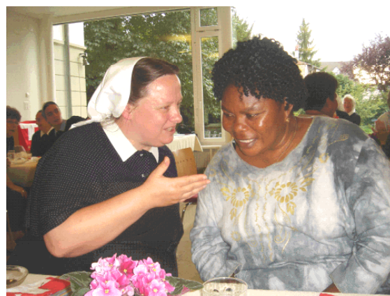
Discussion on the theme

The love of Christ is the model! A social charity, enlightened and well informed, has learned to deal are fully with this ideal. It is understood. Everyone who gives professional care has to keep his distance from the client and still allow closeness in the relationship. The question is, should the tension between social work and Christian service be dealt with as a contradiction between an ideal theology and a realistic psychology? I want to show that within biblical sources of charity there exists a helpful disposition indeed to reflect this tension in a productive way.