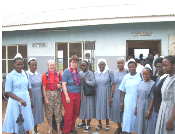
Sisters in Bukoba, Namalira

Tanzania/Namalira – to receive a further instalment for their education programme and a report had been submitted.