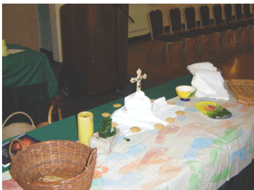
Worship table at DOTAC conference

The cultural evening was composed of story tellers, dancers, steel drums, singing and there was a representation of the many cultures that make up Trinidad and Tobago – Chinese, Indian from India, Caucasian and Black (who had been slaves on the Island coming from Africa).