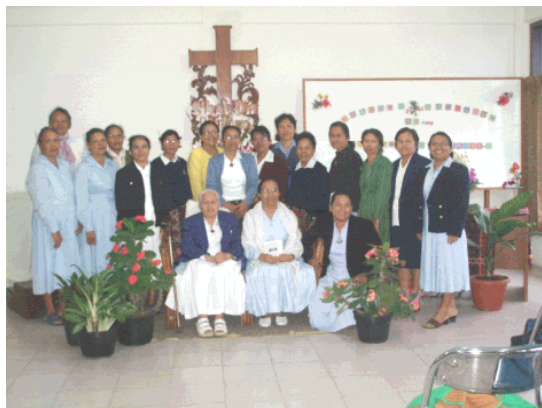
Regional meeting of IKADIWA, Indonesia

Indonesia – the Deaconess School of the HKBP to be granted 4,000 Euro towards a new student bus on the proviso that they could find further funding.