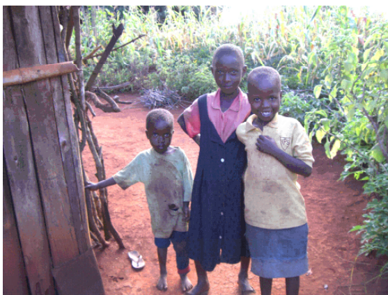
Children in Kenya

Kenya: 5000 Euro was given from the emergency fund to help get crops and farms going again after a severe drought.