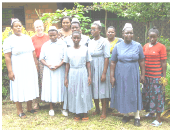
Deacons Tmshibire, Karagwe

broken and there is hardly any medicine. It is a very hard situation for the workers who are educated midwives, nurses and health care assistants. They all need a lot of enthusiasm, flexibility and creativity to do their work.