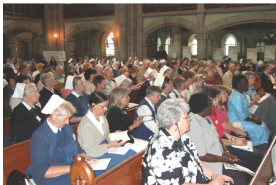
Matthäus Church, Basel/Switzerland

We met in the Matthäus Church for worship, key speakers, business sessions and small groups but also enjoyed the hospitality of nearby St. Joseph's Church for both a DRAE night and Swiss night.