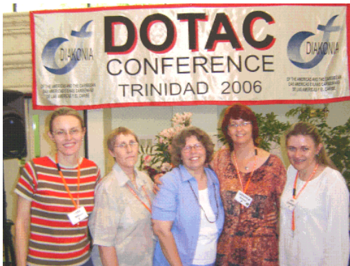
Brazilian delegation at DOTAC Conference

There were theme presenters with an opportunity for small group reflection after each presentation. One day was spent at mission and cultural projects on the two islands of Trinidad and Tobago ending in the evening with a time of theological reflection on the day's activities. Each day began and ended with worship.