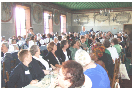
At the Basel Cathedral

Sunday worship was at the magnificent Cathedral where we also enjoyed a tour and our lunch time meal.