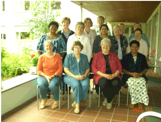
Executive Committee at Riehen/Switzerland

This meeting followed the very good and happy DRAE Conference to which many of the Executive were able to attend. We were hosted by the Motherhouse in Riehen and it was good to have that fellowship and friendship renewed.