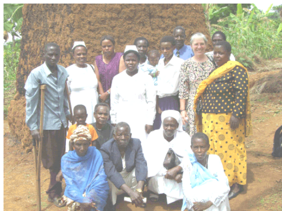
Bethany Group, Bukoba

Faraja diaconal centre (Ushirika Wa Dia-konia). They have a 3 year programme to educate deacons. They also have a second practical training so they can work in various jobs afterwards. There are 18 ordained deacons and 12 in training. Connected with the school is an elementary school for disabled children.