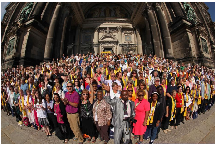
Participants of DIAKONIA World Assembly 2013 in front of the Berlin Cathedral

For more information contact the website. Participants of the DIAKONIA World Assembly in Berlin can receive all keynotes and photos. In this case, please contact the Secretary: secretary@diakonia-world.org