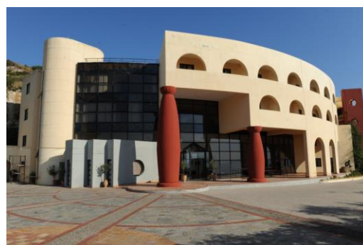
The Orthodox Academy of Crete

3. The 60 th Central Committee meeting of WCC was in Kolymari, Crete, 28 th August – 5 th September 2012 under the theme of Busan Assembly