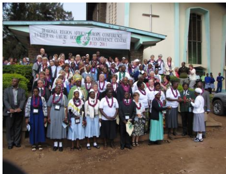
DRAE Regional Conference in Moshi/Tanzania