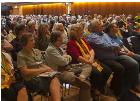
Auditorium at the DIAKONIA World Assembly in Berlin, July 2013

During the past four years we have managed to publish an issue of DIAKONIA News every year. We feel confident that the DIAKONIA News publications have presented a broad picture of the DIAKONIA World Federation as a whole.