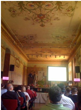
Meeting Room Veleherad

Unfortunately the speaker of the third lecture, Oswald Cardinal Gracias from Mumbai/India could not attend in person. His letter about the role of deacons for the new evangelization in a diverse context was read.