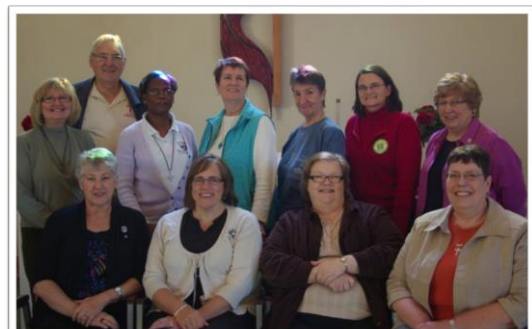
DOTAC Central Committee 2012