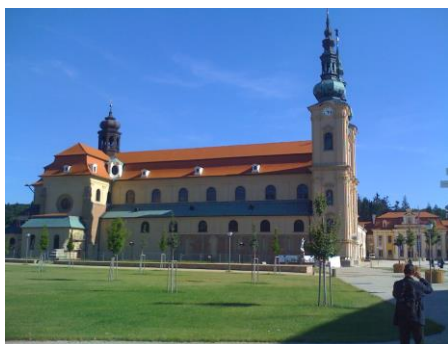
Cathedral of Velehrad

As the DIAKONIA World Federation, the IDC has its own assembly every four years. This year it took place in Velehrad, Czech Republic from June 13-16. The theme was: Diaconia in an intercultural context. Around 120 people, mostly men, gathered at the place, where the Slavic apostles, Cyril and Method lived and worked 1100 years ago. The basilica and