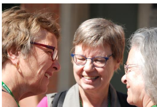
North Europeans at DIAKONIA World Assembly in Berlin

After an intense and lengthy discussion the Executive decided with a lot of faith to accept the invitation to the Philippines for the 22nd DIAKONIA World Assembly 2017.