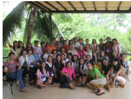
Participants of the DAP Regional Conference