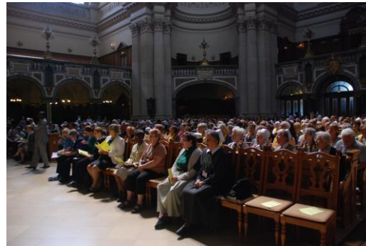
World Focus 3 at Berlin Cathedral