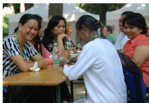
Asians DIAKONIA World Assembly in Berlin