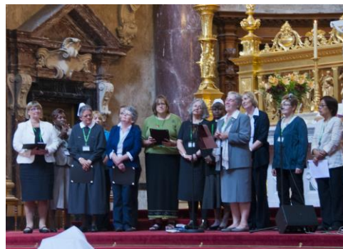
Farewell of the outgoing Executive