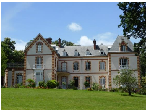
Motherhouse Sisters of Reuilly Versailles, France

This DIAKONIA News aims, among other things, to inform you about discussions and decisions made at the Executive Committee meeting held in July 2016 in Versailles.