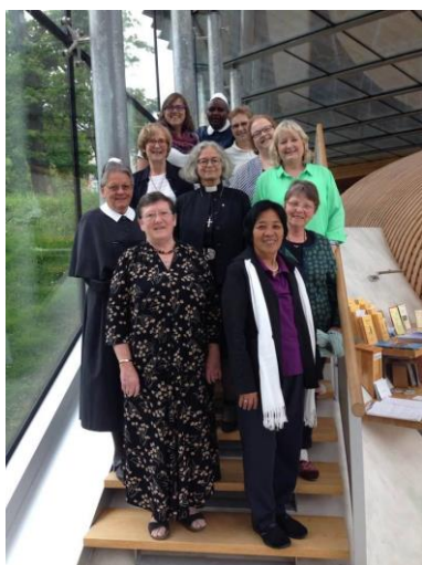
DIAKONIA World Executive at Versailles, France

The DIAKONIA World Federation Executive Committee met in Versailles, France, at the Communauté des Diaconesses de Reuilly from July 2 to 7, 2016.