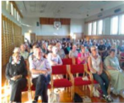
At the DRAE Conference

musician, where we were treated to a wonderful concert with piano and violin; thoughtful and insightful presentations by various speakers; and many great conversations with participants.