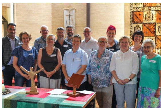
DUCA NSWACT Deacons