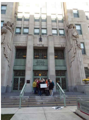
Executive Committee at Loyola University, where the 2017 Assembly will take place

The Executive noted that no new applications had been received and committed to being pro-active in promoting opportunities to fund projects that meet the DIAKAID criteria. Regional presidents will provide information and receive applications.