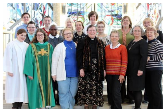
Executive Committee with deaconesses at Valparaiso University Chapel