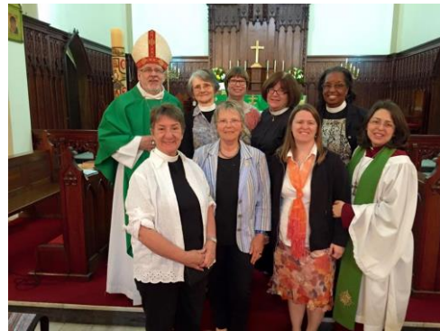
Anglican Service at DOTAC Conference

Through action and reflection, diakonia intends to promote people's ascension from under the table to around the table. The conference will include presentations, Bible study, workshops, worship, and small group time to explore these questions raised by the theme. A very comprehensive range of visits to social and diaconal projects has been arranged. The DOTAC Central Committee will meet before the Conference, and I hope to be able to join them for a day. I am privileged to have been asked to prepare a sermon for the closing worship. I am very much looking forward to the opportunity to meet diaconal ministry agents in the DOTAC region.