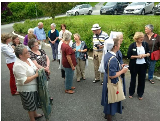
Welcome at Kongshaug

Such a theme seemed appropriate for the difficult and stormy times in which we live, and, at the Conference, we wondered, "What does the Eye of the Storm mean for us, in this mysterious area, where there is no wind at all?"