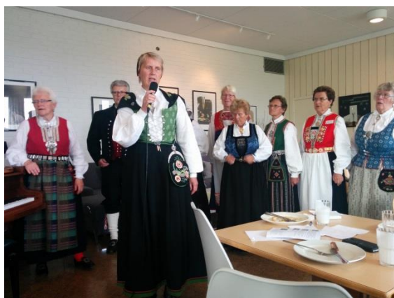
Cultural Evening with traditional Costumes