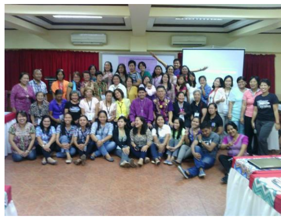
Christian Education Summit Mindanao

The following needs have been identified: further training in leadership, management, and administrative skills; exposure to and immersion in international programs; professionalization; and empowerment. They wish to learn more about the theological perspectives of the deaconess ministry. As in the past, some of them have gone to the Philippines for learning, study tours, and immersion.