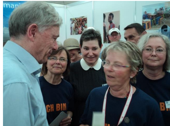
Former German President Köhler visits the information booth at Church Day

werth Verband, VEDD, and DWF shared an information booth.