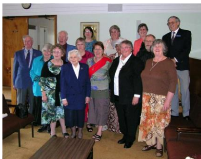
Methodist Deacons New Zealand

The diaconate in the Methodist Church of New Zealand currently appears to be in recess.