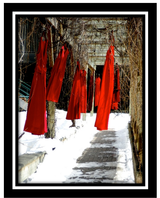
(c) 2011 Jaime Black. The REDress Project. Photo credit: Jaime Black http://www.redressproject.org

It's been a little over five weeks since the 160 attendees at the 2019 DOTAC Conference left Vancouver, British Columbia to return home. I often return home from Regional or World Gatherings full of renewed friendships, challenged to think about our call to diakonia, to contemplate the things in the world that are not "of God", the places where we are made aware of the many ways we have fallen short of God's glory.