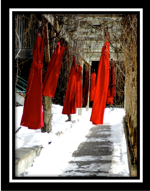
(c) 2011 Jaime Black. The REDress Project. Photo credit: Jaime Black http://www.redressproject.org

It's been a little over five weeks since the 160 attendees at the 2019 DOTAC Conference left Vancouver, British Columbia to return home. I often return home from Regional or World Gatherings full of renewed friendships, challenged to think about our call to diakonia, to contemplate the things in the world that are not "of God", the places where we are made aware of the many ways we have fallen short of God's glory.